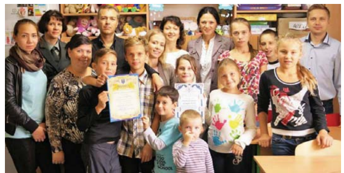
Some of Island of Hope Center children and staff.

A full sponsorship of just $60 per month provides seven days of care each week,