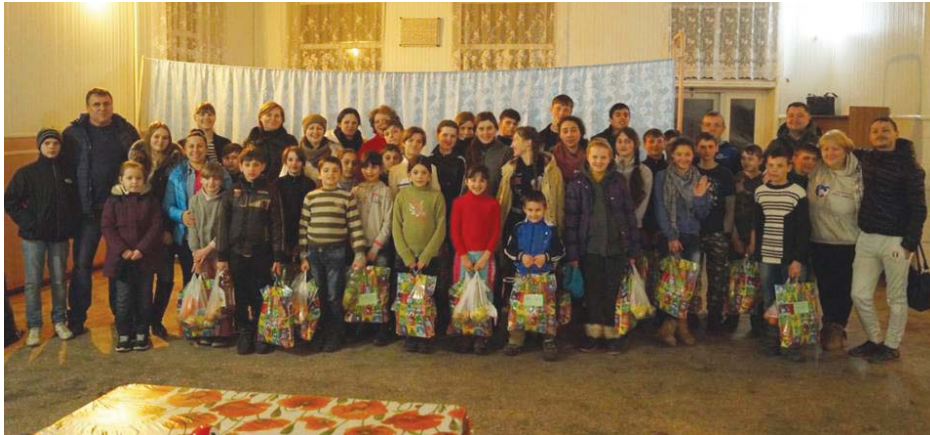
Part of the Zhovten State Orphanage children with Nourished Hearts team members during Holiday visit in January, 2017..

Zhovten is a town approximately 100 kilometers north of Odessa. Our team travels two hours each way, two times a month